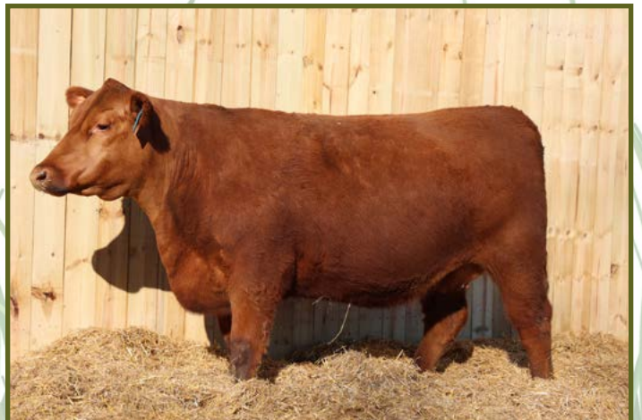
Lot 3 DIX BELGA 354G

LSF TAKEOVER 9943W BROWN MS DESTINATION T7634 MLK CRK EPIC 9175 ANDRAS REBA 7065 ANDRAS LEGEND X11 WOF SAL 876 BROWN COVENANT U7548 OOF BELGA 1162