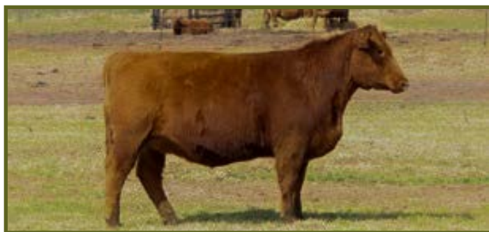
Lot 59 JYJ MS BELIEVE H372

S A V FINAL ANSWER 0035 BROWN MS MISSION STMT X7559 BROWN OBJECTIVE U7528 BROWN MS F442 P7917 CCF SEQUOYA 0361 LCC REBELLA NA123 HXC CONQUEST 4405P JYJ MS MAJOR LEAGUE W19