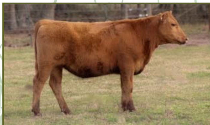
Lot 81 JYJ MS HARDDRIVE J475

This lady is the granddaughter of Redemption, the #1 bull in the breed for four consecutive years a few years back. He really made some fine daughters that we still have in production today; they are easy-fleshing, eye-appealing, good mamas that raise excellent calves. This granddaughter has a bright future with her 9% HPG and outstanding GridMaster index and Marbling traits. Her daughters will surely find themselves on the replacement list for KEEPS!