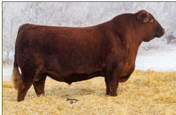
RED DKF RACER 8E Sire of Lot 65

She will be in the show on Friday evening and is destined to be a highlight in the sale on Saturday!