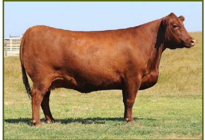
NSFR MTX W14 — Lot 32, 33 & 35 Dam

Consigned by Travis Giffey / Five Oaks Farm Sparta, Tennessee • 931/260-1478 • travis@5oaks.farm