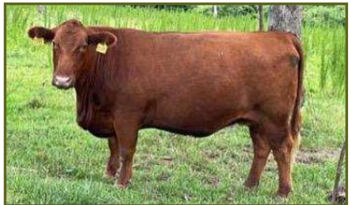
Jolene LB136 106F Dam of Lot 24A & B