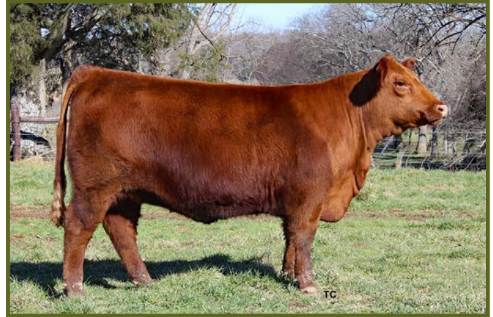
Lot 54 SL MS 713 FORTUNATE 2009

This big broody female is long sided and deep bodied. She is big boned and structurally sound. Her dam produced the high selling bull of the 2019 Kentucky Beef Expo Red Angus sale. She was A.I. bred to Bieber Spartan on 12-2-2021 and pasture exposed to SL 1296 MR COACH 2007 December 5-26-2021. Pasture exposed to yearling bulls after that.