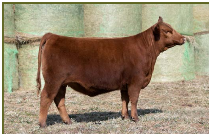
Lot 69 PR3S CORONITA J252

Exciting way to start off our group of open females with this Mulberry Daughter. Out of an excellent young Nexus Daughter that goes back to the Elora 23T female that was a staple in both the Blairs Ag and Damar Farm programs. A soft made female that excels in terms of depth and body capacity. If her striking profile doesn't catch your eyes, she also carries a strong set of growth epds. Halter broke and has been shown.