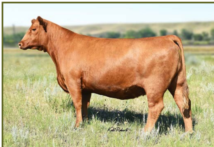
Lot 93 Dam—LSF SRR Dina U8031