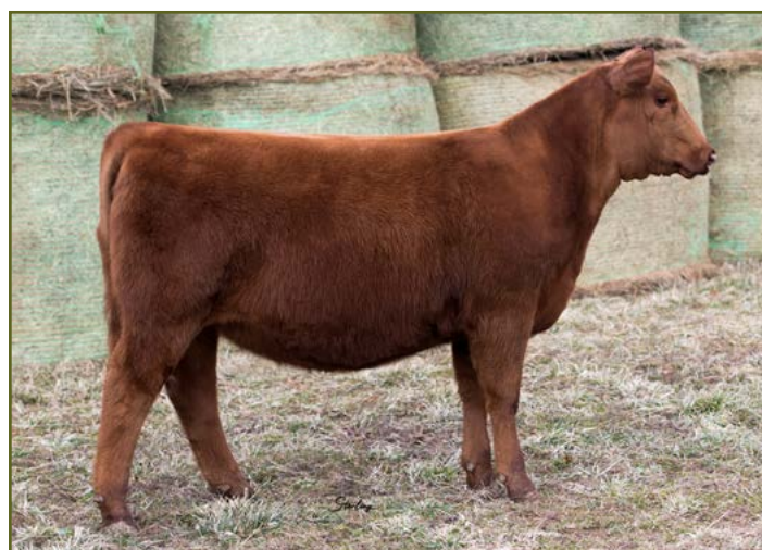
Lot 72 PREZ SUN GAL J261

And last but not least this Dark, cherry red female rounds out our group of open females we have consigned this year. A female that has a presence that catches your eye no matter where you are in the pasture. Attractive through her front third, bold in her rib cage, and square when you get in behind this female. 261's mother was a class winner at NAILE. Broke to tie.