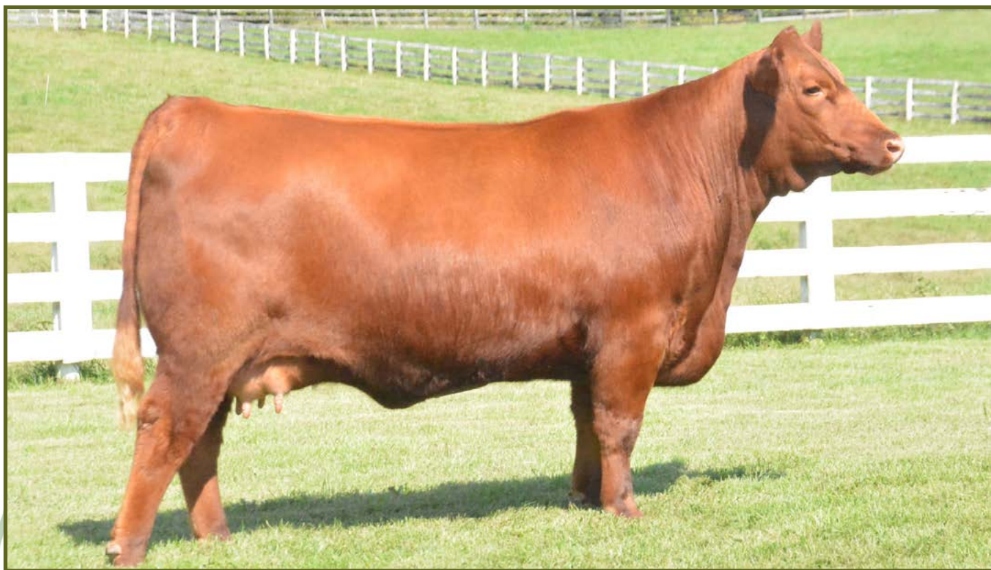
Miss Cora 6601D selling 3 embryos by Fusion R236. Guarantee one pregnancy