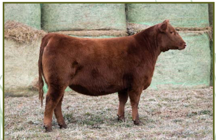
Lot 53 PRESNELL FIREFLY H233

Another excellent bred heifer, that you have to admire for just her and width and dimension that she offers while still maintaining structural integrity. The D155 sire is the result of an embryo package we purchase at the NWSS quite a few year wanting to incorporate some genetics from the Persuasion cow family that has progeny around the country. AI bred 12/30/2021 to Silveras Mission Nexus 1378. Confirmed safe to AI Date