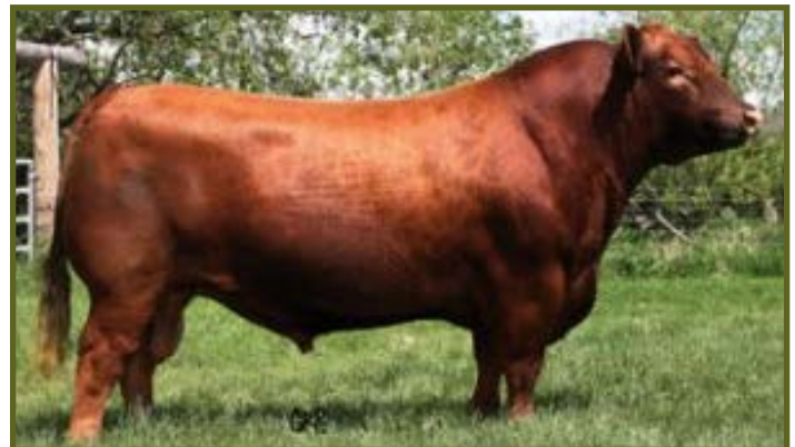
RED SIX MILE SAKIC 832S Maternal Grandsire of Lot 32 & 33

50AK MTX 0305, is one of two flushmate sisters sired by the great FCC Rambo 502. With over 2500 progeny in the book, Rambo transcends time as a sire known for maternal qualities with tremendous amount of shape, look, and style that he has become so widely popular for transmitting to his offspring. Backed by a tremendous cow family, the MTX W14 dam has nearly 150 progeny in the book herself. She's simply never missed! 0305 has extra stoutness of foot and bone to accompany her style and pedigree. 0304 is the second flushmate sister from the Rambo x MTX W14. She is a shapely made, super attractive, dark cherry red female that has the added extension, pin width, and dimension necessary to compliment many of today's popular sire choices!