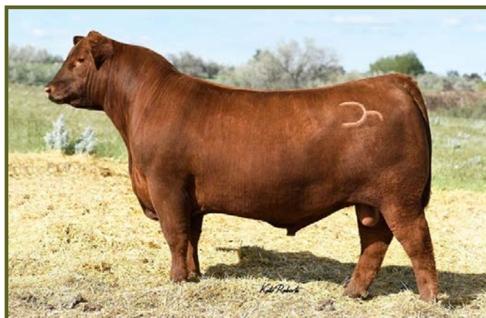
Lot 91 Sire — EGL Guidance 9117