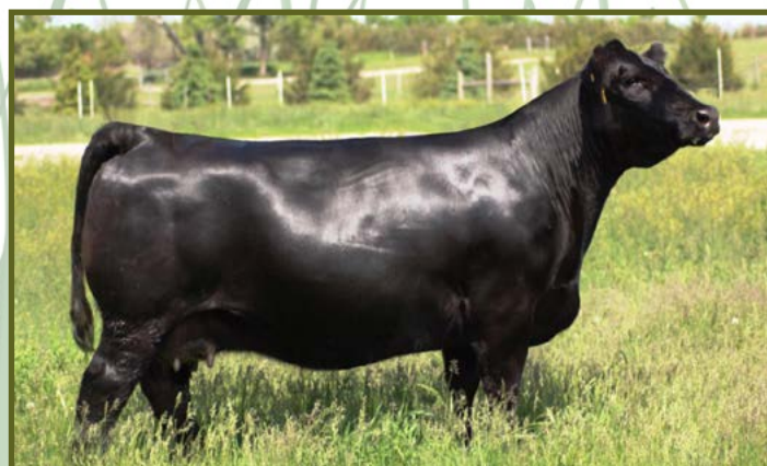
Miss Werning KP 8543U — Lot 100 & 101 Paternal Granddam

REMINGTON LOCK N LOAD 54U AUBREYS BLACK BLAZE III WAGR DREAM CATCHER 03R MISS WERNING 534R RED SOO LINE POWER EYE 161X DAMAR OH BABY W168 RED LAZY MC SMASH 41N SIX MILE LAKOTA 112Y