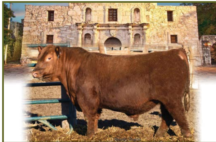
LASO Alamo C92H Service Sire of Lot 49