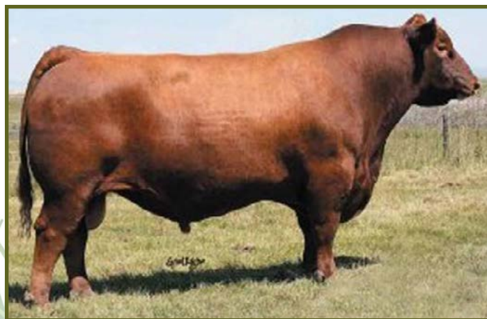
RED FINE LINE MULBERRY 26P Maternal Grandsire of Lot 25B

CCF GOLD BAR 0251 LACY MS CHEROKEE 557P LJC MISSION STATEMENT P27 BASIN LAURA 5301 RED COMPASS MULBERRY 449M RED DUS FAYETTE 8G BROWN VACATION H7106 SUNR CHEROKEE TILLY 303