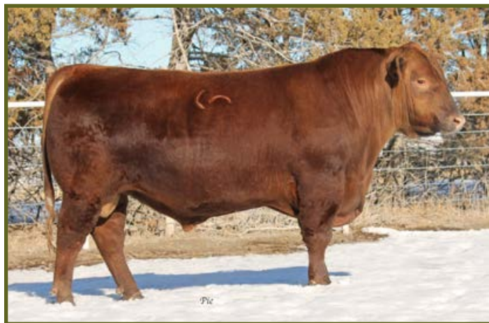
LSF SAGA 1040Y Paternal Grandsire of Lot 35

Notes: Another direct daughter of one of our most prolific donors to date, NSFR MTX W14. W14 has near to 150 progeny in the book. This LSF sired daughter, like her dam has sound udder, good running gear and a great disposition. Her observed maternal traits matchup with the characteristics we see on paper. And to top it all off, she is pasture exposed to Damar Trump C512. Don't miss this quality cow, with a great opportunity queued up for next fall.