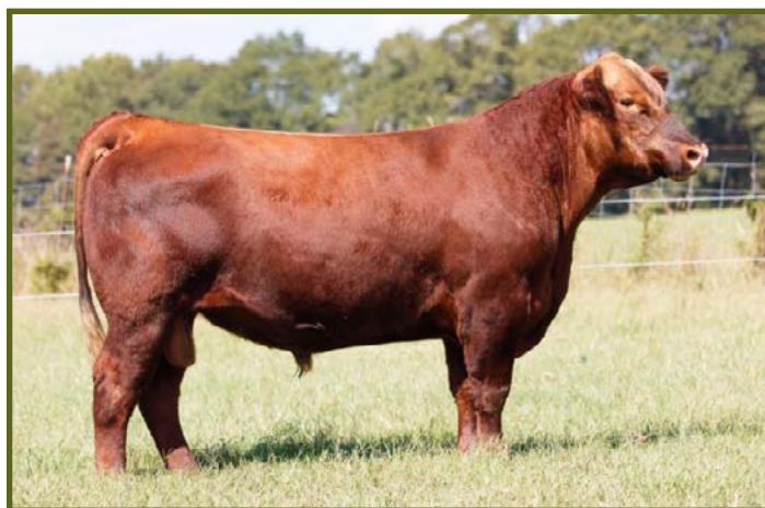
RLL 84S THE ROCK 723 Sire of Lots 18, 19, & 66