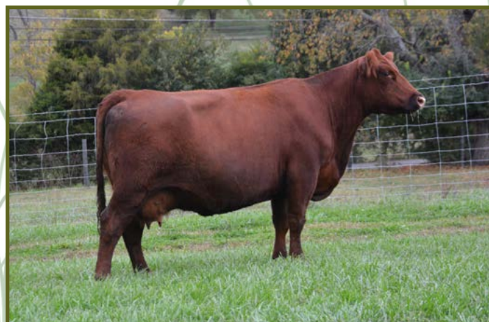
Lot 62 CEDAR RIDGE ROJO 124J

This November born embryo heifer calf is the one to latch on to! She has all of the bells and whistles to be a great show project. More importantly, she comes from a super proven donor in our program and she is sure to make an excellent production female and future donor when her show days are over. Dam of 124J