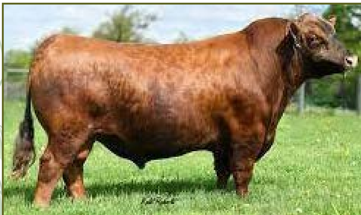
9 MILE FRANCHISE 6305 Sire of Lot 88

This fancy Franchise son offers the chance to buy a direct son of the legendary McRae's Reba 49W cow. I have followed this cow for quite some time. She has had top sellers in several sales but most impressive is that she will have her own themed sale call the RED REBA Fancy Gathering sale in 2023. Cattle tracing back to her qualify for this event. Looking for a really good bull out of a reputation donor, this is your chance.