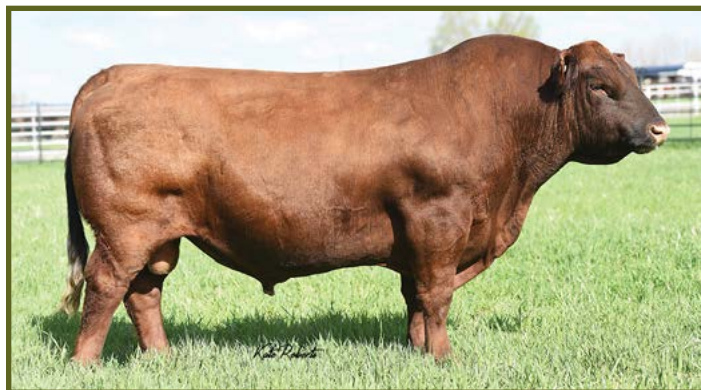
WFL MERLIN 018A Sire of Lot 89 EMBRYOS

Due to 106 being so highly fertile we are able to offer 3 Merlin sired embryos resulting from a flush in which she produced 22 grade 1's. The resulting progeny will stack highly proven genetics both top and bottom. The unprecedented Merlin and Julian B571 herd sires have made their marks across the breed. The results of this mating will be in the elite top 1% REA and top 25% in EPDs for WW, YW and MB. This is a mating that should not only have the stoutness and presence of their impressive dam as well as the highly proven stature of Merlin. 106's flush mate sister, 104F will both carry on this cherished cow family for VVF. Guaranteeing 1 pregnancy if implanted by an AETA technician within 2 years of sale date.