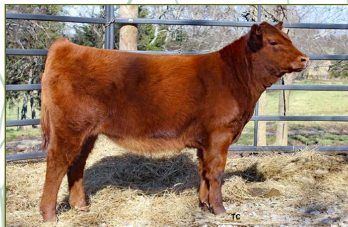
Lot 73 SL MS E639 SPARTAN 2110