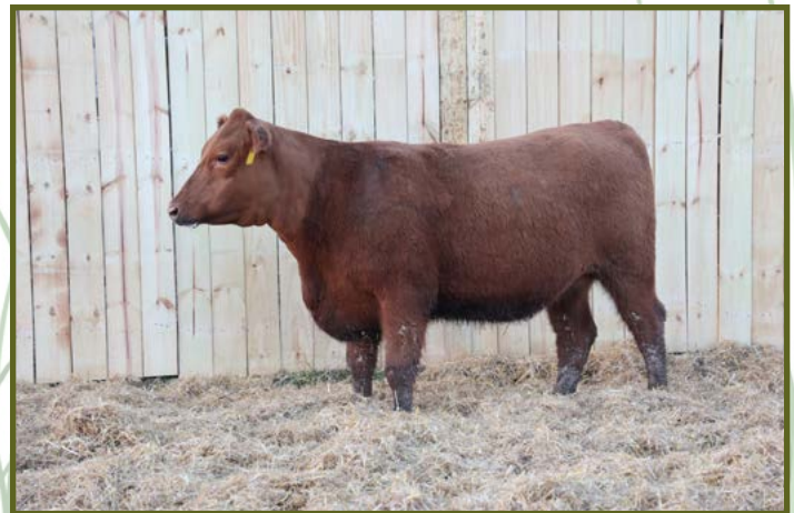
Lot 28 DIX DYNETT 384H

This heifer has a bit more frame to her than some of my other lots but she is awful deep made and attractive! I look for her to make a really stout made, powerful cow that will raise top weaning calves. Her sire, Andras Ultimatum E026, is probably the most outstanding bull we've used in the pasture up to date. He consistently stamps his progeny with extreme depth of rib, true power, and style; this heifer definitely has that. Her dam is a nice made, good milking cow that carries a 102 MPPA. She sells A.I. bred to LSF SRR Primefactor 9014G on 12-2-21 then P.E. to LSF SRR Excellence 8167F.