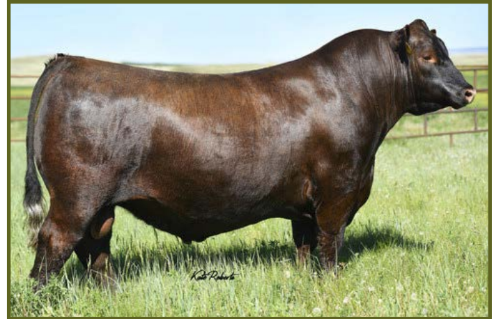
BB Propulsion 9096 Service Sire of Lot 48

Bull Hill Bertha 6323, Reg. # 3740727. A nice uddered, five year old female carrying an embryo by BB Propulsion 9096, Reg. # 4169122, and out of Bull Hill Wendy 1033, Reg. # 1509569. Wendy 1033 is a second generation donor cow with amazing phenotype and performance. Her Marksman son was a crowd favorite at our recent bull sale, and her daughters will impact our herd for years to come. Propulsion is siring sale toppers all over the country, and he ranks in the top 35 % of the breed for twelve different traits and indexes. A very complete package with a solid recipient carrying breed leading, outcross genetics for many producers. Embryo implanted 12/29/21. Breeding update and video available on our website: bullhillredangusranch.com