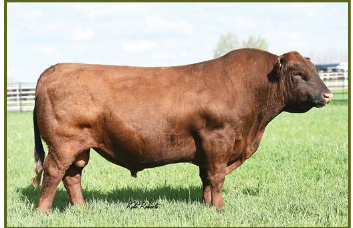
WFL MERLIN 018A Sire of Lot 45

Sired by WFL Merlin 018A & out of a VGW Password 170 daughter that goes back maternally to PRF Dina P236 (Milky Ways dam). Lots of potential growth in this young replacement heifer. Pasture exposed 1-12-2022 to 4-1-2022 to our new herdsire JLW Prospect 5114 (#4333429).