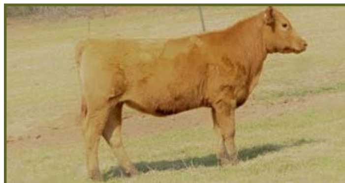
Lot 79 JYJ MS BELIEVE J446