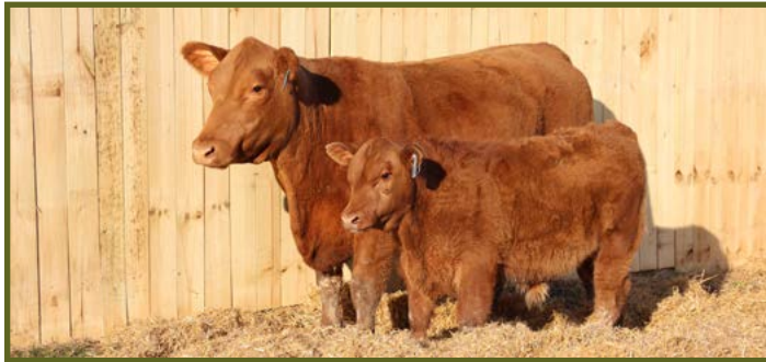
Lot 2 DIX MS OMAK 113C 351G