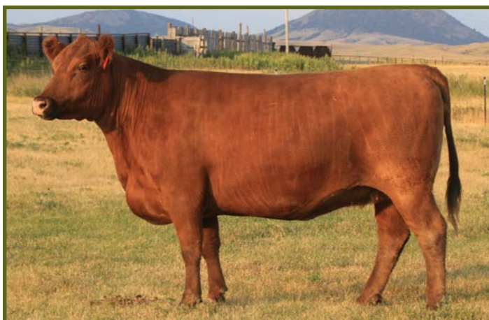
Lot 91 Dam — BJR Dakel 703E