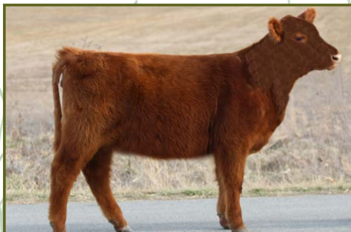
Lot 67 REBA JAYLO 213J

This female is a fancy and stylish built show heifer prospect. Her refined head and neck coupled with good rib shape and depth of body, will always have their attention from the side. Sired by our herd sire REBA Double Down, who has done a tremendous job for us producing high quality females and bulls. But this female has the potential to change a breeding program and produce high quality offspring of her own.