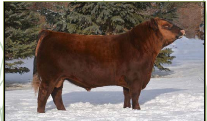
DAMAR TRUMP C512 Sire of Lot 31; Service Sire of Lots 34 & 35

Breeding information — Pasture exposed to Damar Trump C512 12/17/21 to 1/23/22 This moderate framed, sound structured 6 year old, has plenty of rib capacity, good feet and a solid udder. Her herd builder EPD scores confirm her observed production capabilities. Pasture exposed to Damar Trump C512. A top notch cow with a long term opportunity lined up for October.