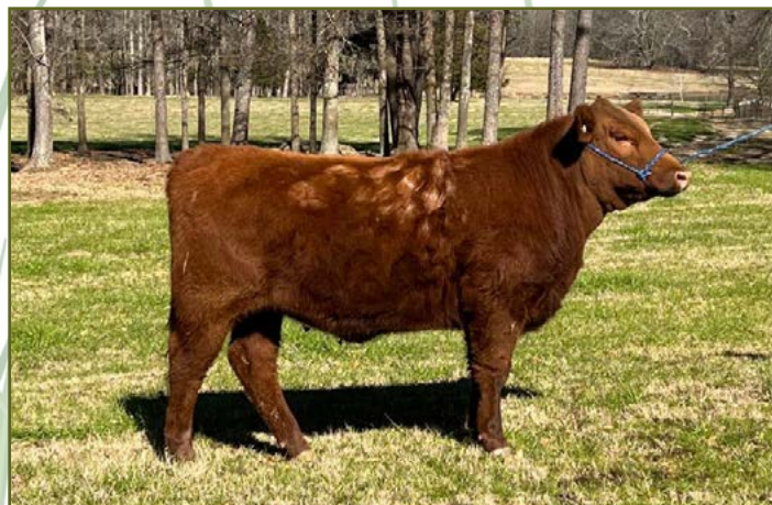
Lot 22 RVC STOCKMAN'S OPAL

RVC Stockmans Opal is a deep bodied, sure-footed heifer that shows great maternal potential. She is a direct descendant of Pie Stockman and Bieber Rose. Her dam has proven to be an asset to building a herd with strong genetics. She is pasture exposed to Shady's Fusion F203 (#4032130) on 1/26/2021.