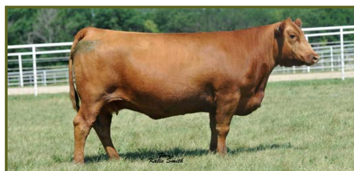
RED MCRAE'S REBA 49W Dam of Lot 88

SPUR FRANCHISE 7070 H & H IRENE LASS 0135 TR COLT 45 UT806 C-BAR & BROWN ABIGRACE T712 5L GUNS BLAZIN 637-5874 5L SILKWOOD 9161-1173 RED FLYING K PRINCE 171M RED MCRAE'S REBA 25J