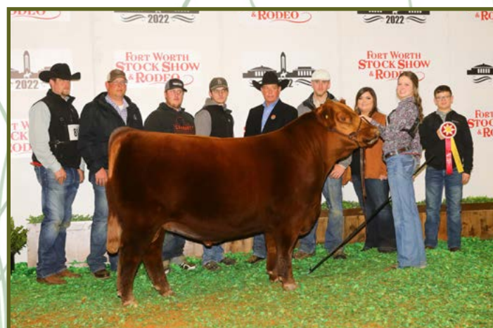
Lot 84 flush mate full brother(Cedar Ridge Hellcat 052H) FWSS Res Grand

Big time herd sire prospect with 6 traits in the top 30% or better of the breed. Home Run will add power and pounds to a calf crop while putting excellent feet and legs on them. Don't strike out, hit a Home Run.