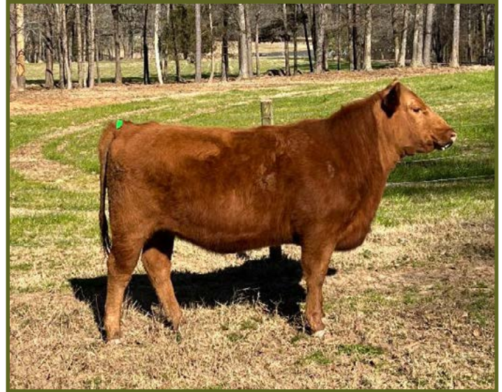
Lot 23 RVC'S STOCKMAN'S VIOLET

RVC Stockmans Violet will be a great addition to any herd. She originates from the great Beckton Nebula and her bloodlines are proven to be some of the best including P707 and Bieber Rose. She's pasture exposed to Shady's Fusion F203 (#4032130) on 1/26/2021.