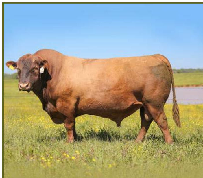
BROWN PACESETTER Y7170 Sire of Lot 10

Very nice Pacesetter daughter with heifer calf at side by Diamond P ELI a son of Red Soo Line Power Eye. Cow was AI bred to Six Mile Tidal Wave on 1/19/22 and then PE to WDSC Boudreaux #4417029 from 1/20/22 to 3/1/22. If you are looking for performance look no further than this cow she is in the top 21%ProS, 7%GM, 12%WW, 16%YW, 3% Milk, 5%Marb, 6%CW & 7% REA WOW!!