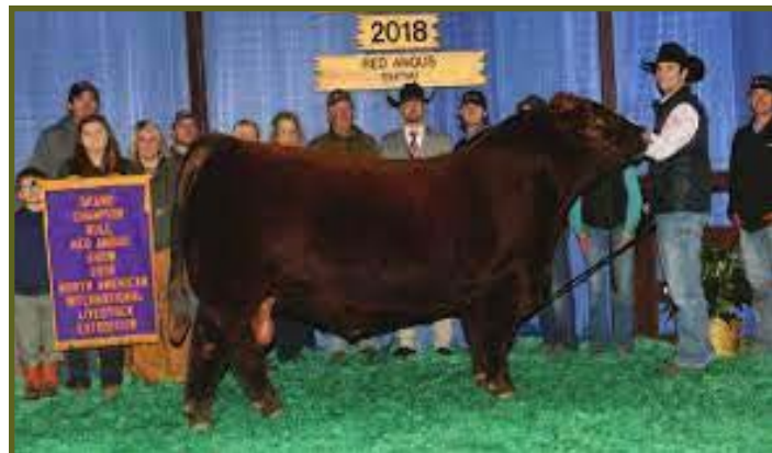
DAMAR MIMI E381 Sire of Lot 30 & 63

Just a March heifer out of the Pride A274 dam. The Dam has produced several champion and high selling females in the past 6 year. This heifer is also out of the Popular Damar Mimi E381 bull.