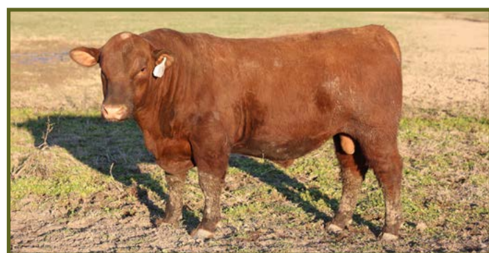
Lot 83 DIX FOREFRONT 387H