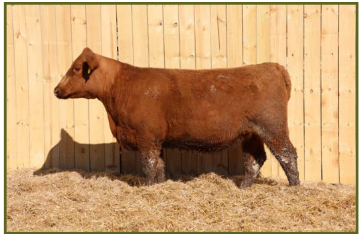
Lot 27 DIX TAMARA 1132 377H

I think you'll really like this heifer here. She comes from the great Tamara cow family and is out of a big, stout made, good uddered female that raises some great calves! She is really nicely made, very attractive, and has great depth of body. I look for her to make a really easy keeping, powerful brood cow. She sells A.I. bred to LSF SRR Primefactor 9014G on 12-2-21 then P.E. to LSF SRR Excellence 8167F.