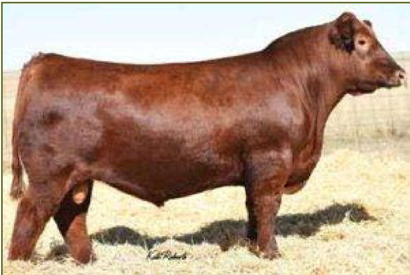
GMRA TESLA 6214 Sire of Lot 13