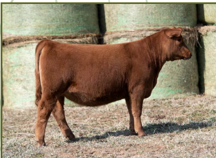
Lot 70 PREZ DIPY DO J260

A personal favorite of mine here, a female that is super complete. Moderate made, extra flexible, and soft middle, this female does a lot of things right. Extra quiet disposition. Halter Broke.