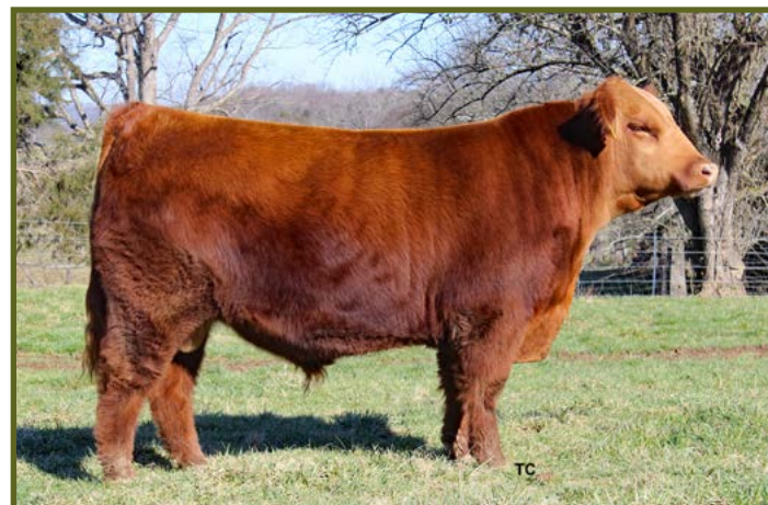
Lot 87 SL 1296 MR COACH 2003

WOODHILL GAME DAY U6-Y98 MR DAWN 2507S M R COLA 4118 M R ROYAL 5196S BROWN SYNERGY X7838 4L FAY BERRY 401 4L 1925 EXT 413 4L MS LIGHTNING 252