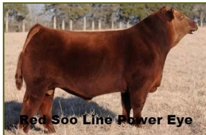
RED SOO LINE POWER EYE 161X Sire of Lot 82

Who needs an outcross shot of power in their herd? A 19 month old RED SOO LINE POWER 161X sired bull out of our Victoria donor who is bred by the great Red Six Mile Sakic 832S and out of a Glacier Chateau dam. Victoria 832 is going on 15 years old and has a calf by her side now. She has consistently raised our best calves who always wean over 500lbs and her offspring females are still in our herd following in her footsteps! Add the Power Eye bull and "oh my"! From an EPD standpoint, this bull has a 13 on CED, A -.9 on BW, a 59 on WW, a 94 YW, and a 23 on Milk. All of this with pretty good accuracies backing this your bull. AND he looks the part. In Tennessee, he meets all of the requirements for TAEP enhancement program so you could get some money to go towards your purchase. Get this bull home and turn him out in the front pasture knowing better days lie ahead from making this investment. Please follow Bell Farms Red Angus on Facebook for more up to date info, pics and videos as we get closer to the sale.