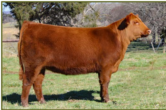
Lot 55 SL MS 6517 EPIC 2014