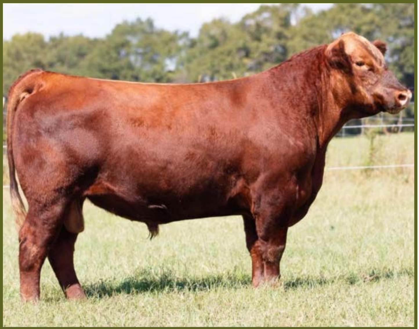
RLL 84S THE ROCK 723 Sire of Lots 18, 19, & 66