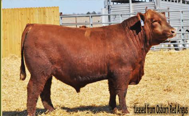
ANDRAS ULTIMATUM E026 (3768697)

A really nice Heifer that we raised and was purchased by Andras Stock Farm