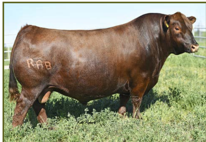
Lot 93 Sire—Bieber CL Energize F121

BJR Dina 850F [3942227] is the 8th consecutive generation of donors from the great Dina cow family! Dina 850F ranks in top 1-35% for ProS, GM, CED, BW, ADG, Milk, HPG, CEM, Marb, YG, REA. Her dam, Dina D6403 is proven to be one of the best daughters of the popular Night Calver. D6403's sons averaged $7500 Spring 2021. Another elite D6403 daughter by Brunswick [BJR Dina 011H – 4241350] is a next level donor for BJR. This Dina 850F x Energize mating will rank in top 1-10% for ProS, GM, CED, BW, ADG, CEM, Marb, REA and top 11-35% for YW, Milk, HPG, CW. 3 Conventional Embryos @ Genex Billings X Bieber CL Energize F121 [3958815] is a genetic superstar @ ABS. He ranks in Top 1-10% for ProS, GM, CED, BW, ADG, CEM, REA and Top 11-35% for HB, WW, YW, Stay, Marb, CW. He adds rib and muscle in a calving ease package. Note his MGDam is the same as Stockmarket.