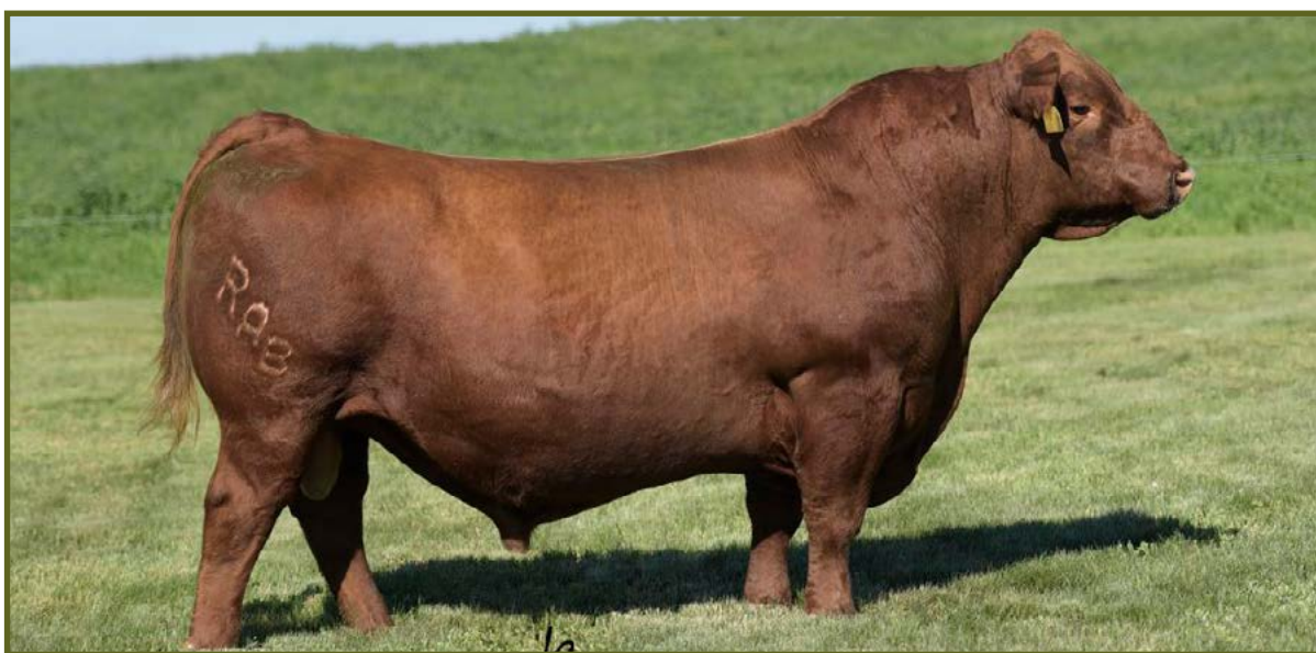
BIEBER HARD DRIVE Y120 Sire of Lots 25A & 25B

Another Hard Drive x Tilly that offers top of the breed growth, carcass and ProS EPDs. Her dam was one of our featured consignments to the '21 Grasstime selling to J Bar S, Mendenhall, MS where they state she is doing more than they could have ever expected! X02 is an extremely fertile donor that left us several replacements and a son VETO Guardian we are using for natural service. 930 has several full brothers that will be offered in the spring '22 Ludvigson 'Cornhusker' bull sale. Both of these sisters are backed by top of the breed EPDs, and a proven, time tested cow family. They offer the phenotype and natural thickness that will have them making an impact within any program. Al'd 12/5/21 to the $119,000 top selling bull of the breed for 2019, LSF SRR President 8177F, that's recently taken the breed by storm with his first progeny coming to the forefront. PE to VETO Oscar 1E3 (4012554) a Feddes Oscar X28 x Dakota Rambler 75R son that's one of our powerful natural service sires who stacks 5 generations of proven AI sires. His progeny are impressing us. As an added bonus she sells with 2 straws of semen from our newest herd sire addition, LSF SRR EZ Factor, an LSF SRR X Factor son that was a top selling herd bull of the Ludvigson dispersal who offers outstanding calving ease with breed leading carcass traits.