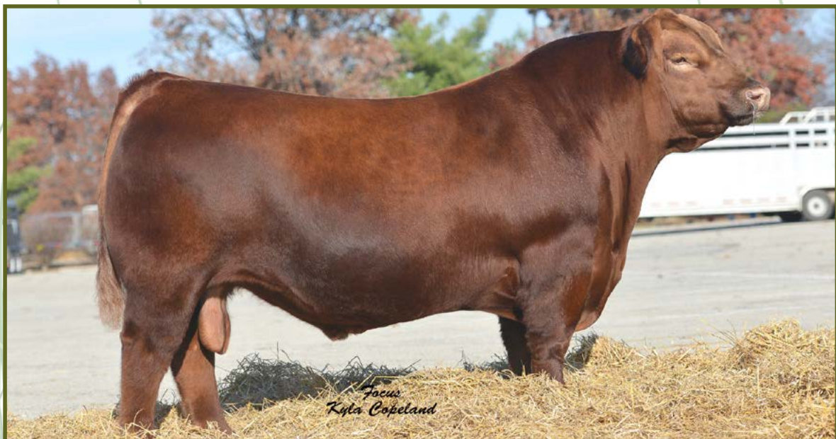
SILVEIRAS MISSION NEXUS 1378 Paternal Grandsire of Lot 64