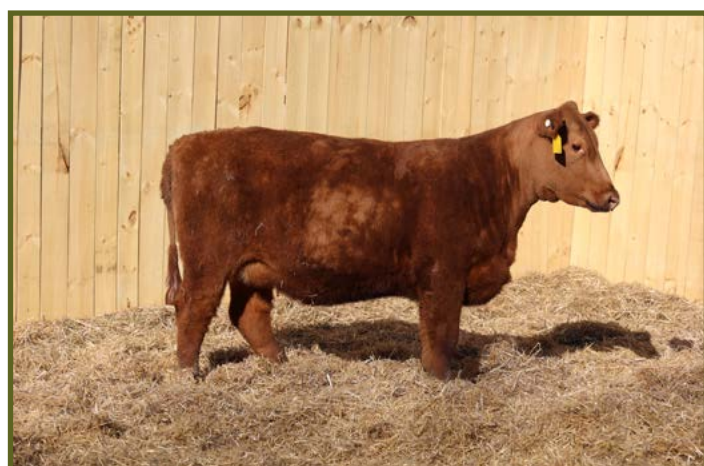
Lot 61b DIX CHEROK 1402 215J