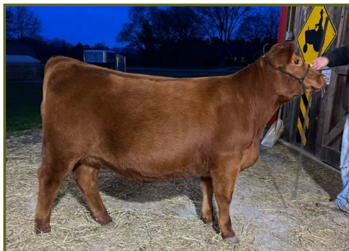
Lot 64 BRIAR RIDGE MS PRIDE 16

MS PRIDE 16 is a heifer that has done well on our show string this fall and one that we debated on keeping to show as a bred heifer. MISS PRIDE 8119F half sister won a class in both the NAILE and the Cattlemen's Congress for us this year. MS PRIDE 16 grand dam is the DAMAR X056 PRIDE cow that was purchased from the Cloud 9 Cattle company a few years back. She has produced countless heifers that have dominated across the board. Going back to the SILVEIRAS MISSION NEXUS on the top this pedigree speaks for itself. With a striking profile and easy disposition MS PRIDE 16 is one you don't want to miss out on!