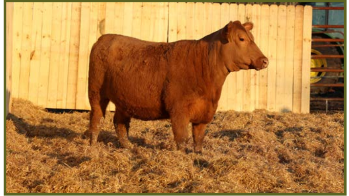
Lot 26 DIX RUE B039 381H ET

Here's a lovely ET bred heifer out of one of our donors, Andras Rue B039, that's a great producer! Her dam raises one of the top calves year in and year out and this heifer is definitely going to be a great one from her also! She is sired by the well known WFL Profitmaker E7030 bull that has sired great calves all over the country. This heifer is extremely smooth made, slick haired, and fancy as they come! She's been a standout from day one and continues to be really impressive and one of the very top heifers in her group. She sells A.I. bred to LSF SRR Primefactor 9014G on 12-2-21 then P.E. to LSF SRR Excellence 8167F.