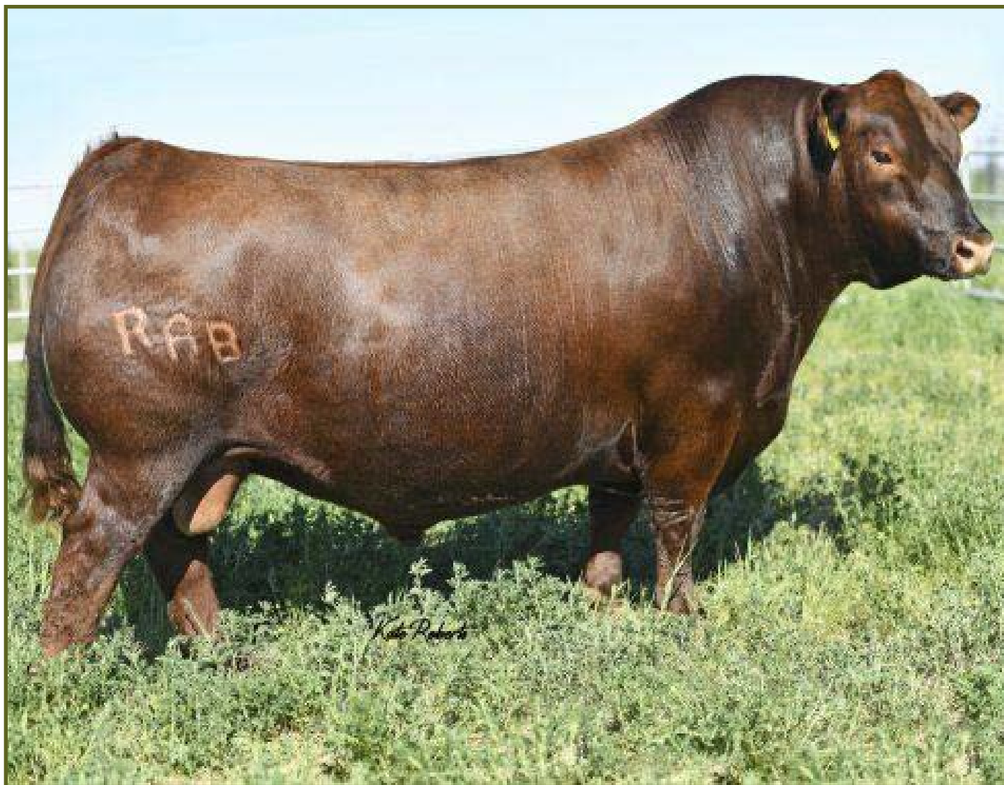
BIEBER CL ENERGIZER F121 Sire of Lot 77A