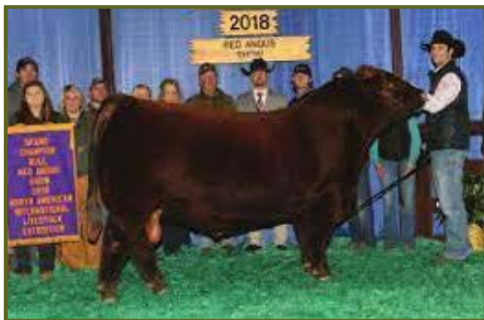
DAMAR MIMI E381 Sire of Lot 30 & 63

This heifer is a really moderate made, very well put together female that comes from the great Osce cow family. She's very feminine, sharp made, and slick haired. Her maternal grand dam is still in production at 17 years of age with a 106 MPPA that's calved 14 calves and is about to calve her 15th; longevity at its finest! She sells A.I. bred to LSF SRR Primefactor 9014G on 12-2-21 then P.E. to LSF SRR Excellence 8167F.