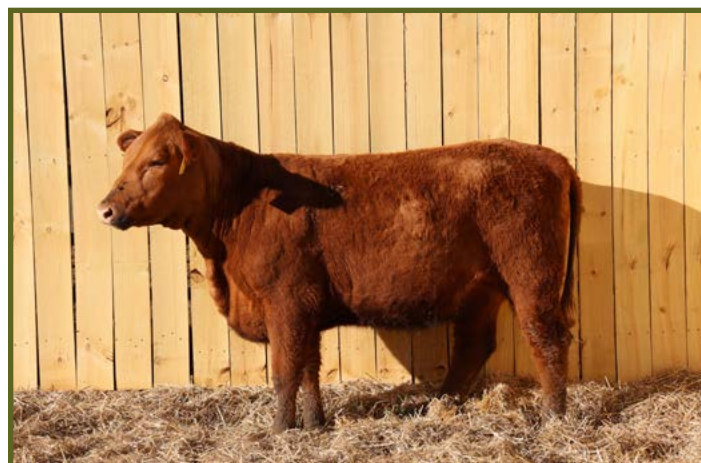
Lot 61a DIX ALBANY C155 219J

Athens Alabama • 256/614-4212 • jdixon@dixonstables.com