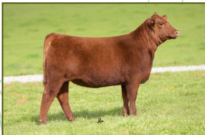
Lot 31 5OAK MTX 0302 Yearling

5OAK MTX 0302 is another daughter of the proven NSFR MTX W14 matron that was an integral part of the Rust Mountain View Ranch program we acquired. 0302 is sired by the multiple-time National Champion, Damar Trump C512. She is an ultra-smooth made, well-balanced female that is high tying in her neck attachment, clean chested, bold ribbed, and square made. The Trump daughters continue to gain value and popularity as they have entered production. Udder quality, fleshing ability, and strong maternal characteristics are what you will find in this bred female.