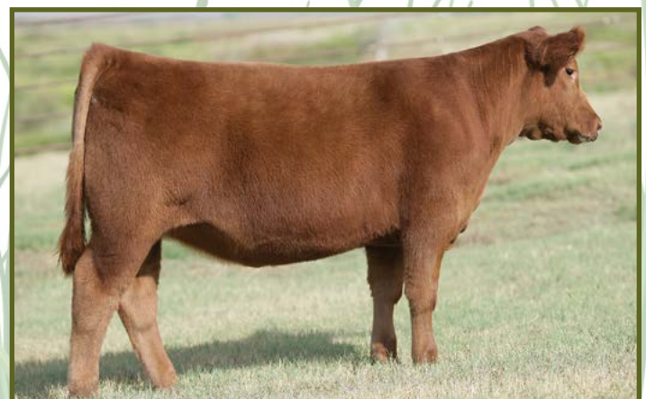
Rojas Cashmere 5036 — Maternal Granddam

Breeding information – Safe in AI, by ultrasound, to Pelton Wideload 78B (Reg. 1704763), due 9/14/22. Pasture exposed to 50AK Trump 0311 (Reg 4376323) 12/17/21 to 2/13/22 50AK Cashmere 0013 carries loads of pedigree from both her Red Angus dam and Simmental sire. Her dam comes out of the lineage of Six Mile Lakota 112Y a Red Angus breed changer who's line runs deep in our herd and the Red Angus breed as a whole. And on the Simmental side 0013 was sired by Loaded up 79C a son of the infamous Miss Werning KP 8543U. Whew!. If that don't get you excited about this heifer, I don't know what will. Bid early and often on this one!