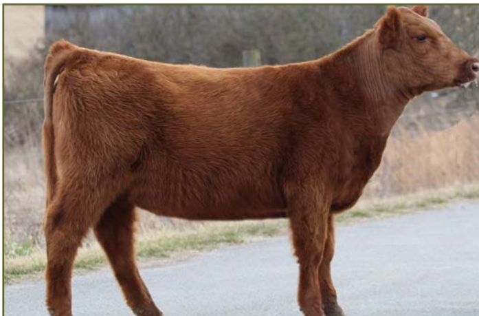
Lot 68 REBA JADE 212J

This young lady gets better every single day! This June baby has kept us on our toes since day one. She has all the pieces and parts to become amazing, she's just needed time to get there. Long sleek fronted, square hiped, and good feet and legs. From an amazing cow family this female has the potential in and out of the showering. If you still need a show heifer to compete with or need to add a little outcross to your breeding program, here she is!