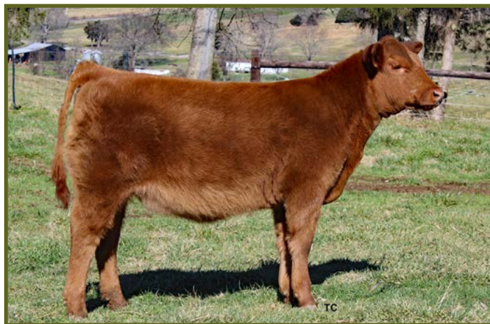
Lot 74 SL MS B563 LET'S ROLL 2112

This Fall heifer calf is long, thick, and very structurally sound. You have to appreciate this daughter of Bieber Let's Roll for her top width and depth of body. She has been a standout calf in the pasture since she was born. She is going to make an outstanding addition to any cow herd. She ranks in the top 19% in ProS, the top 27% in HerdBuilder and the top 29% in Gridmaster. Her cow family is a favorite of ours.