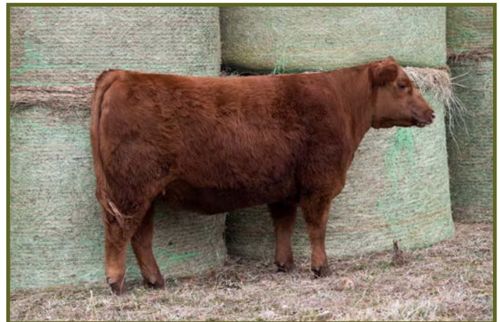
Lot 52 PRESNELL BLOCKANA H232

This is the first time we have ever offered bred females in this sale, and with this one we feel we are offering one of the best. An ET calf out of the NAILE champion Lion Heart A25 back on our Ana Z21 donor who was reserve supreme female at the 2013 NC State Fair. AI bred 12/30/2021 to Damar Mimi E381, the NAILE and NWSS. Confirmed safe to AI Date.