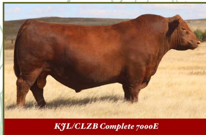
KJL/CLZB Complete 7000E