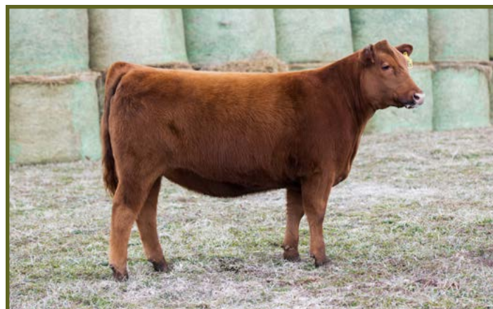
Lot 71 PREZ DAISY J255

Long sided, bold-ribbed female that carries a strong set of maternal epd's. This female along with the J260 and J261 females is sired by our F186 bull that is backed by a cornerstone female of our herd the Bonnebelle B129 female. This heifer would make a great junior project or a front pasture type of female. Halter broke.