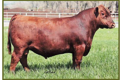
LSF MEW PLATINUM 5660C Sire of Lot 1

S A V FINAL ANSWER 0035 BROWN MS MISSION STMT X7559 LCC NEW STANDARD BROWN MS DESTINATION U7733 BECKTON NEBULA P P707 BROWN MS ABIGRACE L7730 CBR RAM 3109-936 JLRA DYANA