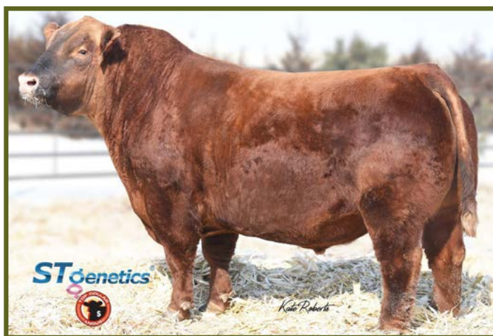
PIE JUST RIGHT 540 Sire of Lot 94

Bull Hill Susie 3072, Reg. # 955848, x PIE Just Right 540, Reg. # 3503313. The Susie cow has a 111 lifetime MPPA, with progeny working in herds all over the country. Several of her daughters are stand outs in our herd and one is a donor for J Bar S Cattle in MS. She has produced numerous show ring champions and herd sires for purebred and commercial operations. PIE Just Right has been a prominent sire for Pieper Red Angus in NE, and is siring big footed, growthy, structurally correct cattle with lots of eye appeal. Don't miss this rare opportunity to add the powerful genetics of this mating to your program! Three grade one embryos with guarantee of one pregnancy if implanted by a certified technician.