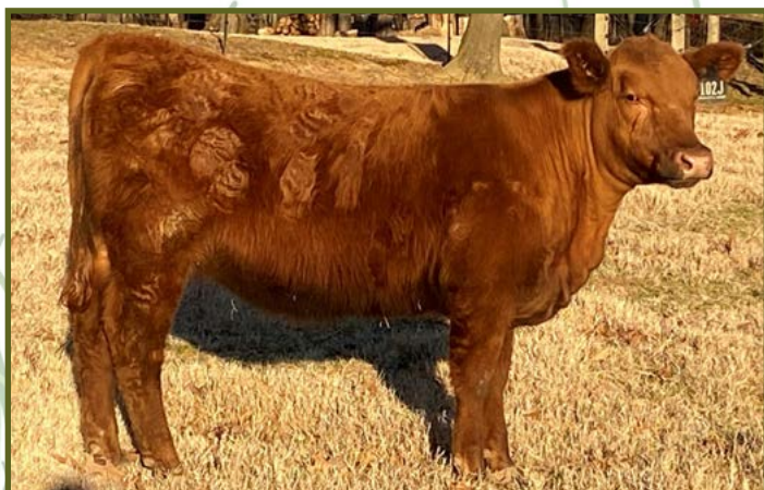
Lot 76 W3CC JAY-LO 102J

This dark red heifer has the Show Vibes. Lots of Hair with some Show Genetics. She is halter broke, been to shows, and has a future to go. She is a granddaughter of JKC Huckleberry 701 on dam side. On sire side is the granddaughter of Bieber Rollin Deep Y118.