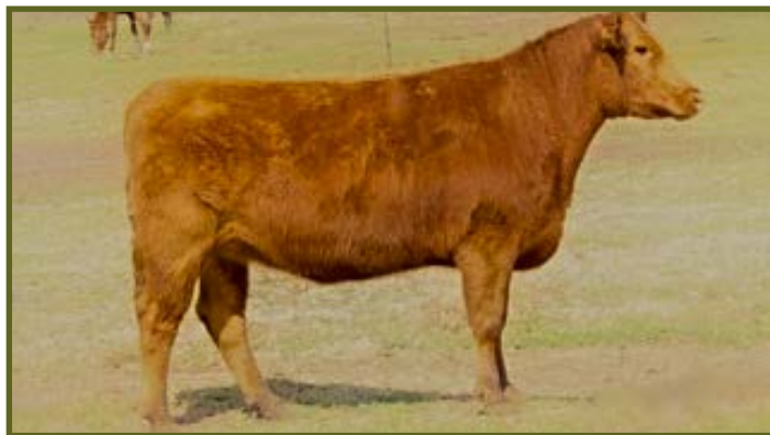
Lot 57 TW ANGEL GIRL 5220

Angel Girl 5220 is an AI daughter of Collier Finished Product that has performed well. Very balanced EPD profile that will make you a cow with wide range of breeding options for your herd. She is AI bred in 1/2/2022 to Bieber CL Energize F121. The current expected EPDS for this mating ProS 153 HB 81 GM 72 CED 17 BW -4.8 WW 64 YW 114 Milk 27 will have complete updated profile on display sale day. 5220 Maternal Granddam has a 102 MPPA with 5 calves produced and still working in my herd. A really great opportunity to add multi generation AI genetics to your herd.