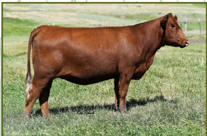
Lot 92 Dam — BJR Copper Queen 801F