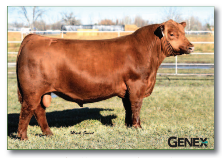
H2R Profitbuilder B403 • Sire of Lots 8 and 11

Lot 8 is one of the top EPD females of the day and it is no doubt why, being sired by Profitbuilder and a dam sired by Bieber Rollin Deep. Expect great things from this young Red Angus standout.