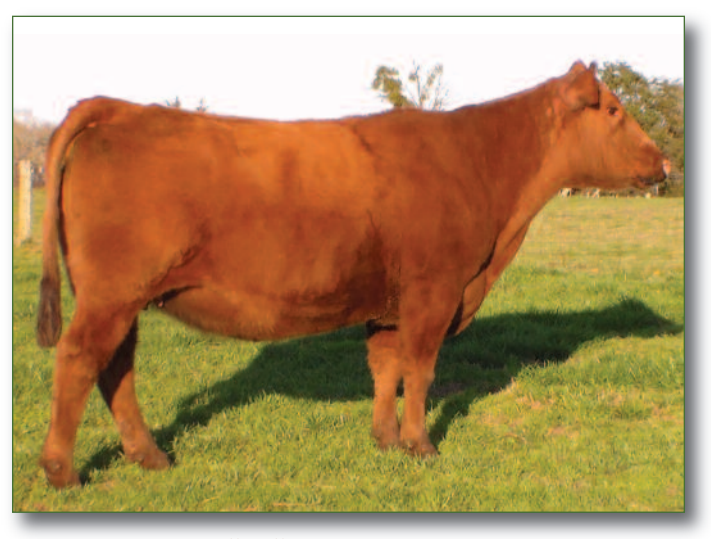
Bull Hill Susie 1047 • Lot 22

This powerful, young Shooter daughter ranks in the top 25% of the breed for six different traits and indexes! She is a very clean fronted, correct female from the Juana cow family that performs well for us year after year. A.I. bred on 2/21/18 to HXC Declaration 5504C (#3494198). Calf's projected EPDs: HB 129, GM 57, CED 3, BW -0.2, WW 75, YW 128, Milk 19, ME -1, HPG 9, CEM 3, Stay 10, Marb 0.82, YG -0.01, CW 46, REA 0.29, Fat -0.03. Video can be viewed at bullhillredangusranch.com.