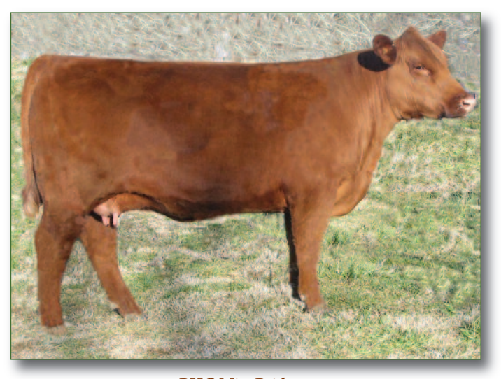
BHC Miss Bridget Dam of Lot 37 and Maternal Granddam of Lot 38

This is a good dark red cow with good size and a nice udder. She will have a calf by sale time sired by WCS FUSION 456 7L (#3754931).