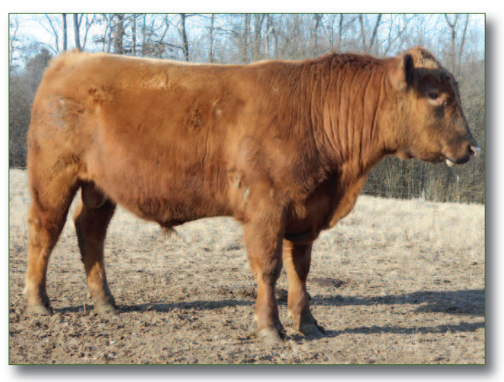
JLW Password 4710 • Lot 78

Very nice herd sire prospect out of one of our most productive Abigrace Donors. He's a Mulberry son that has 8 EPDs in top 25%. Very good EPD set, Mulberry and Abigrace in his pedigree, not much more to be said.