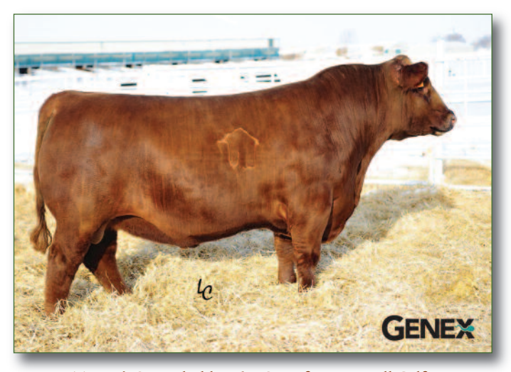
Trotter's Stronghold 156 • Sire of Lot 13 Bull Calf

Lot 12 offers six EPD traits in the top 20% of the Red Angus breed. She is the type of female that will propel your program to the forefront of the industry.