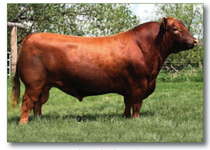
Red Six Mile Sakic 832S Sire of Lot 17 and Maternal Grandsire of Lots 15-16

Here's a very good Six Mile Sakic 832S daughter who would make a great addition to any herd. She's done a great job for us and we fully expect the same expectation for the future buyer. She sells with a young February bull calf (#3845659) by her side. She sells open.