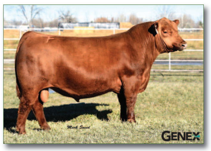
H2R Profit Builder B403 • Service Sire to Lot 20 & 22