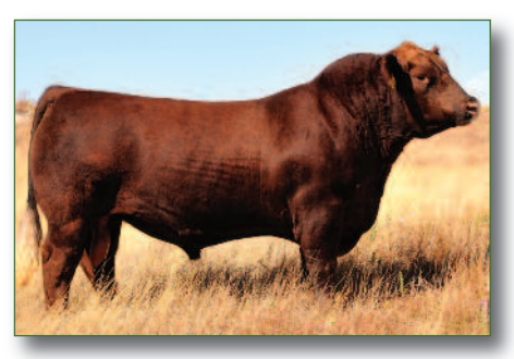
C-Bar-RJ Genesis A31 Semen sells as Lot 83

This is a rare chance at the great cow maker and son of Beckton Julian B571.