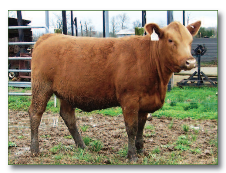
Osborn Ms Sal 211D • Lot 66