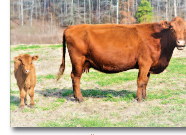
Angel's 302 • Lot 31

This 5-year-old cow has had four calves. She sells with an Andras Mr Black Jeans R179 bull calf at side born on 12/24/17. She exhibits great fertility with calving intervals of 1st on 12-8-14, 2nd on 2-16-16, 3rd on 1-7-17, 4th on 12-24-17. We will Al her to C-Bar Contour 107X (#1045033) and will be pasture exposed to Collier Navaho R827 (#3530566). Breeding info will be update on sale day.