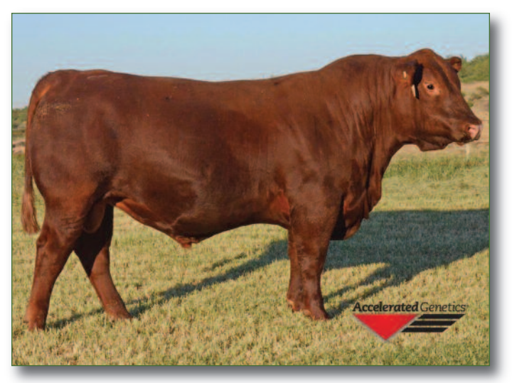
Brown Nice and Easy Z7335 • Sire of Lots 67 and 69

Check out this direct daughter of Accelerated Genetics Brown Nice & Easy (#1550614). D04's dam is a fertile, tight uddered daughter of VGW Password 170 (#1444896). Top 10% HB, top 16% GM. A.I. Bred 12-28-17 to LSF SRR Sleep Easy 4083B (#1681923). Pasture exposed 01-01-18 to 04-06-18 to MPH Catalyst C14 (#3533454).