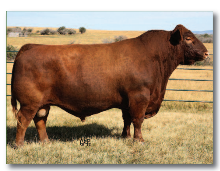
Red Fine Line Mulberry 26P • Sire of Lot 81 Embryos