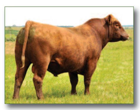
5L Independence 560-298Y