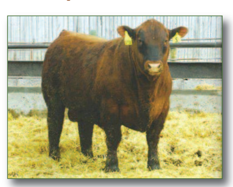
LSF SRR Tyson 3025A