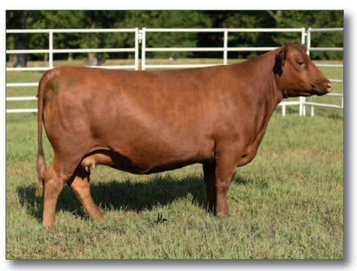
Brown Ms New Era A7084 • Dam of Lot 81 Embryos

Some of the hottest genetices in the breed! A direct daughter of the $2 million Abigrace L7730 cow and the incomparable Mulberry 26P! Selling 3 #1 embryos one (1) extra embryo provided as the up front guarantee.