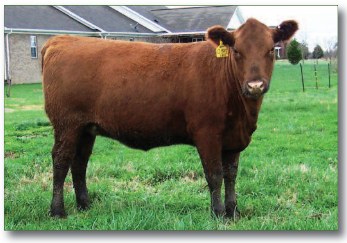
JEM Ms Bertha 248D • Lot 62

Check out this Andras Thunder 2082 daughter out of a Basin Hobo 79E cow from the great Bull Hill program. I expect her to produce very growthy calves and add a dose of carcass quality, too. Her dam, although one of the most moderate cows in the herd, always brings in a good calf and MS Bertha 248D was no exception with a 113 weaning ratio. She is Al bred to Andras Fusion R236 (#1506931) on 1/6/2018 and checked AI bred on 2/13/2018. She is pasture exposed to Osborn Sensation 206D (#3627349) a Brown AA Sensational B5147 son from 1/15/2018.