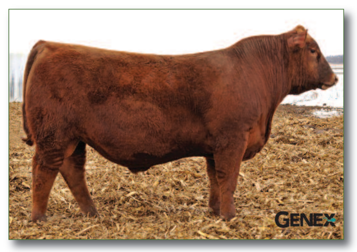
HXC Delcaration 5504C • Sire of Lot 80 Embryos

The dam of these embryos is a full sister to Bieber Commissioner B599, whose cow family is among the most envied and valuable at Bieber's. Selling a package of three (3) #1 grade embryos.