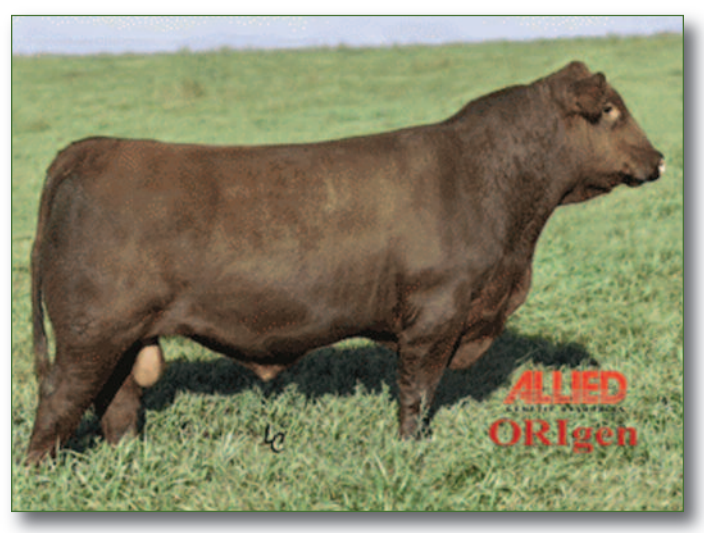
Bieber Commissioner B599 Full brother to dam of Lot 80 Embryos