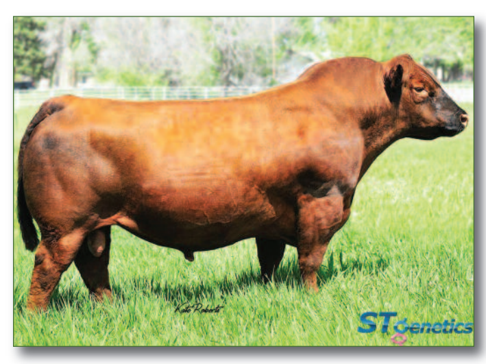
LSF Night Calver 9921W • Sire of Lot 73

This old school mating cow is in the prime of her life. Big time Herdbuilder EPD, she is a maternal producer to the max. Brittney has been a consistent producer for us and she sells confirmed bred to MNS Red Hot 5750, our tremendous Code Red herdsire out of the Shuey program. A heifer calf would be a herdkeeper for sure. Due for a fall calf, all she needs is some grass. PE 01/03/2018 to 03/18/2018.