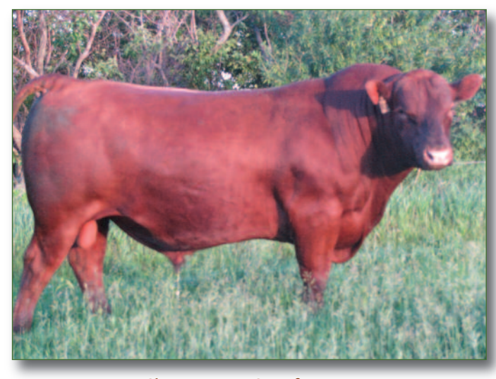
PIE Shooter 8012 • Sire of Lots 21-22