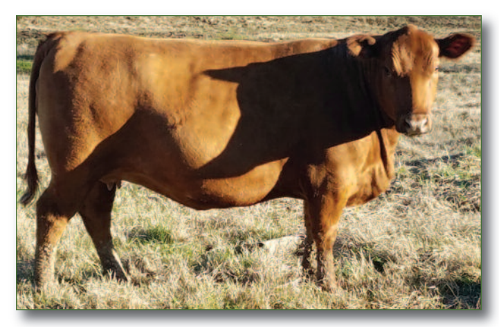
LRF Abby D69 • Lot 61

Lot 59 and 60 are ET flushmates and offer a tremendous opportunity to buy 2 full sisters to put into your herd. The Mulberry daughters make some of the best cows in the industry and their maternal pedigree, loaded with LSF Dina Might and the incredible Bull Hill Chf Lady Donor Matron, make these pairs a "must buy" in Cullman. Help yourself to some of the best Red Angus females to sell this spring auction season! Sells with a Red Angus bull calf at side, born 7/26/2017, sired by PIE CINCH 4126. Cow was A.I. bred on 9/29/2017 to PIE CINCH 4126 then pasure exposed to DEER VALLEY LOGGER 4118 (#17885234) from 10/5/2017. Sells safe in calf!