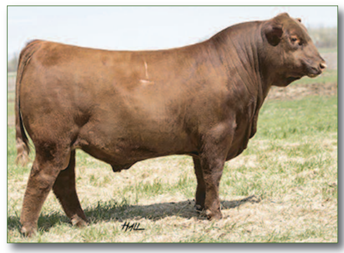
PIE Cinch 4126 • Service Sire to Lot 60

WHOA don't miss this female on April 7th -- she has eight traits in the top 30% of the breed's EPDs, highlighted by a top 2% WW & YW and a top 5% HPG! The Mulberry daughters are legendary for maternal performance. Put this one to work in your herd. Sells with a black bull calf at side born 1/19/2018, BW 70 lbs., sired by an Angus bull (DEER VALLEY LOGGER 4118 #17885234). Breeding information available sale day.