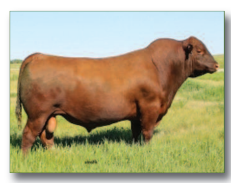
Bieber Let's Roll B563