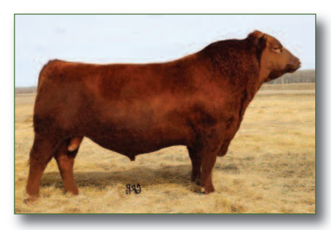
Badlands Opportunity 53Y Semen sells asl Lot 84