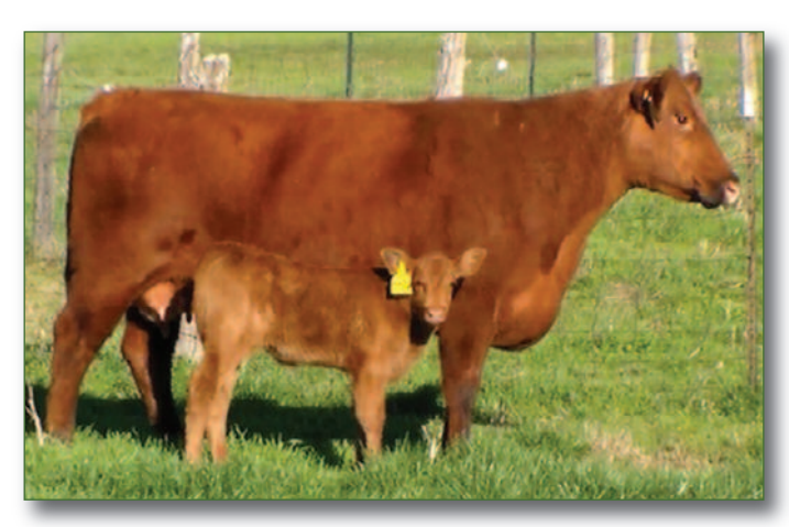
Bull Hill Alexis 1096 • Lot 19