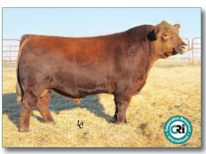
Andras New Direction R240 • Sire of Lot 75