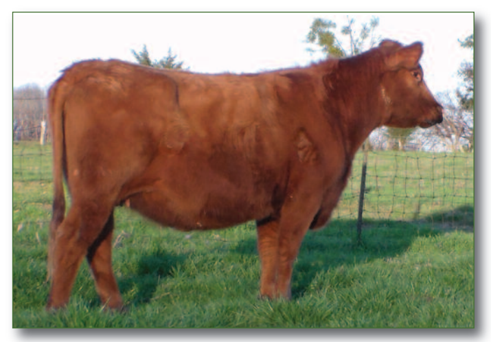
Bull Hill Prissie 3148 • Lot 20