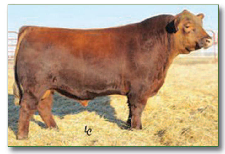
Andras New Direction • Sire of Lot 7

This heifer is out of the 12-year-old Basin Chinook cow that never misses. The Andras New Direction bloodlines have been sale toppers the last several years. This young cow has a lot of money making opportunities ahead of her!