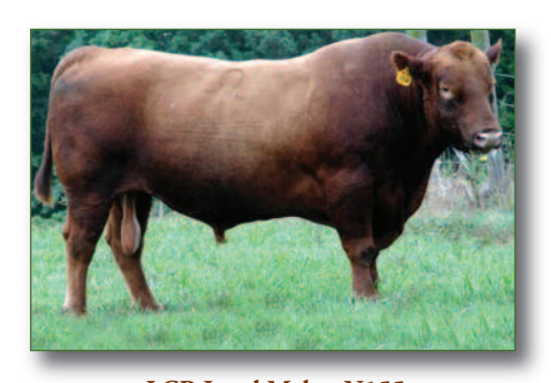
LCB Jewel Maker N155 Semen sells as Lot 85