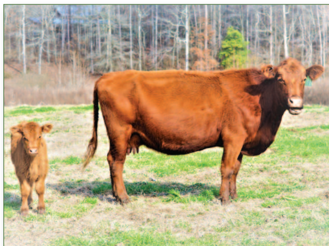
Angel's 302 • Lot 31