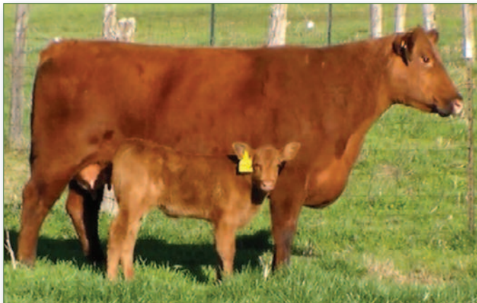
Bull Hill Alexis 1096 • Lot 19