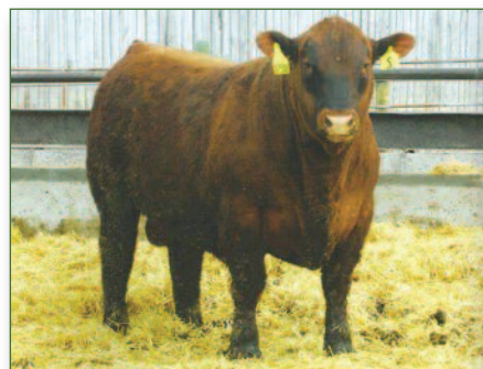
LSF SRR Tyson 3025A

Package A – Sired by LSF SRR Tyson 3025A, $105,000 proven exclusive syndicated sire excelling -4.2 to 111 spreads plus excellent carcass.11 traits in the top 35% or better. The Tyson daughters are proving to be outstanding cows with beautiful udders and elite production. Great outcross to many lines.