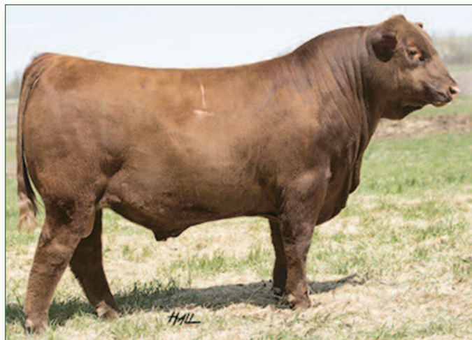
PIE Cinch 4126 • Service Sire to Lot 60

WHOA don't miss this female on April 7th -- she has eight traits in the top 30% of the breed's EPDs, highlighted by a top 2% WW & YW and a top 5% HPG! The Mulberry daughters are legendary for maternal performance. Put this one to work in your herd. Sells with a black bull calf at side born 1/19/2018, BW 70 lbs., sired by an Angus bull (DEER VALLEY LOGGER 4118 #17885234). Breeding information available sale day.