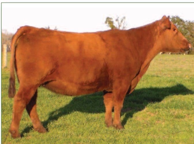
Bull Hill Susie 1047 • Lot 22

This powerful, young Shooter daughter ranks in the top 25% of the breed for six different traits and indexes! She is a very clean fronted, correct female from the Juana cow family that performs well for us year after year. A.I. bred on 2/21/18 to HXC Declaration 5504C (#3494198). Calf's projected EPDs: HB 129, GM 57, CED 3, BW -0.2, WW 75, YW 128, Milk 19, ME -1, HPG 9, CEM 3, Stay 10, Marb 0.82, YG -0.01, CW 46, REA 0.29, Fat -0.03. Video can be viewed at bullhillredangusranch.com.