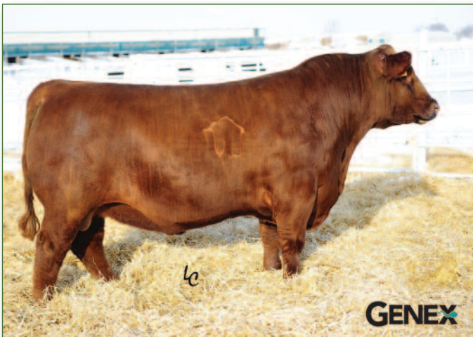
Trotter's Stronghold 156 • Sire of Lot 13 Bull Calf

Consignor: Andblack Red Angus / Joe Andrews Waxhaw, NC / 704-453-1624 / jandjandrews87@gmail.com This Profitbuilder daughter will be just that, ranking in the top 8% and 7% respectively for WW and YW growth traits. If you want to add some power and production into your herd this spring, be in the seats at the Cullman Stockyard on April 7th. The profit builder opportunities for your future beef operation will abound!