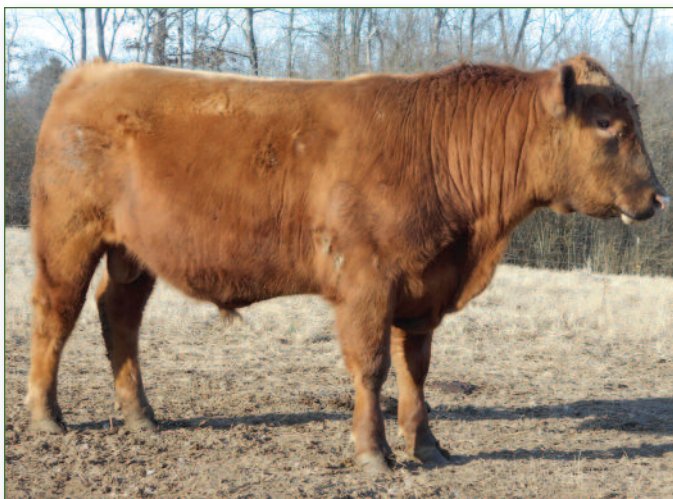
JLW Password 4710 • Lot 78

Very nice herd sire prospect out of one of our most productive Abigrace Donors. He's a Mulberry son that has 8 EPDs in top 25%. Very good EPD set, Mulberry and Abigrace in his pedigree, not much more to be said.