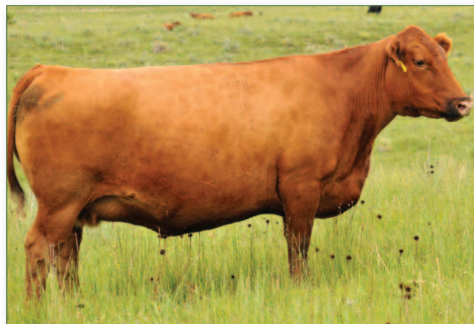
Brown Ms Conquest Z7869 • Dam of Lot 79 Embryos

Each 3-embryo package sired by the elite sires listed. 3 embryos x money for the buyer's package pick – embryos will be available at Genex in Billings, MT for pickup or shipping.