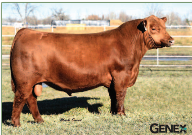
H2R Profitbuilder B403 • Sire of Lots 8 and 11

Lot 8 is one of the top EPD females of the day and it is no doubt why, being sired by Profitbuilder and a dam sired by Bieber Rollin Deep. Expect great things from this young Red Angus standout.