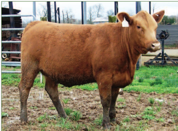
Osborn Ms Sal 211D • Lot 66