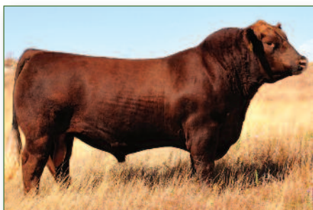
C-Bar-RJ Genesis A31 Semen sells as Lot 83