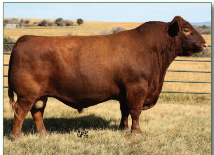
Red Fine Line Mulberry 26P • Sire of Lot 81 Embryos