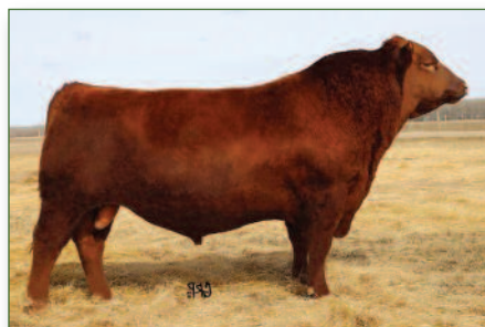
Badlands Opportunity 53Y Semen sells as Lot 84