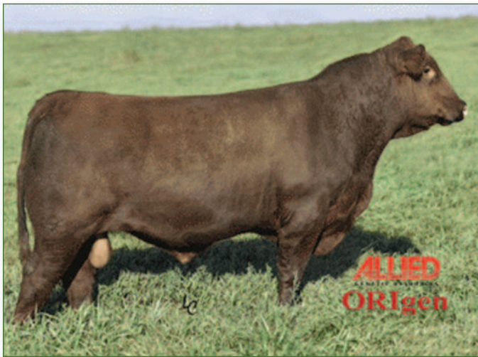
Bieber Commissioner B599 Full brother to dam of Lot 80 Embryos