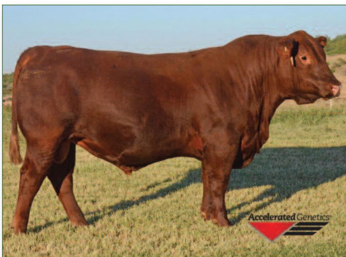
Brown Nice and Easy Z7335 • Sire of Lots 67 and 69

Check out this direct daughter of Accelerated Genetics Brown Nice & Easy (#1550614). D04's dam is a fertile, tight uddered daughter of VGW Password 170 (#1444896). Top 10% HB, top 16% GM. A.I. Bred 12-28-17 to LSF SRR Sleep Easy 4083B (#1681923). Pasture exposed 01-01-18 to 04-06-18 to MPH Catalyst C14 (#3533454).