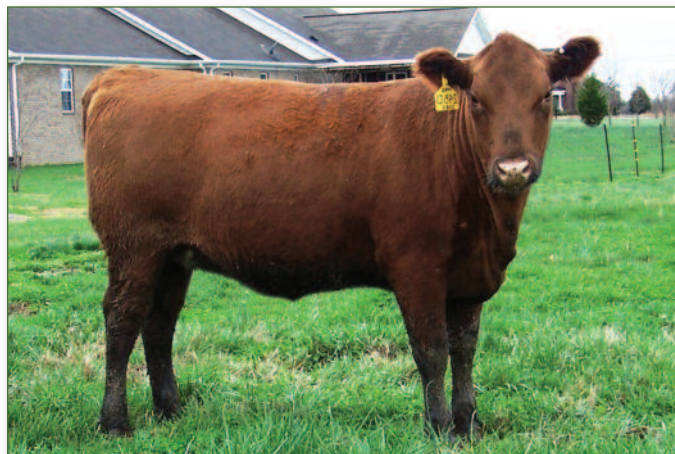
JEM Ms Bertha 248D • Lot 62

BUF CRK HOB0 2595 DOUBLE FORK 079Z LMG GILLS MONUMENT 4562 BULL HILL BERTHA 4077