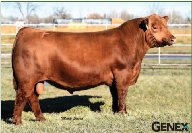
H2R Profit Builder B403 • Service Sire to Lot 20 & 22