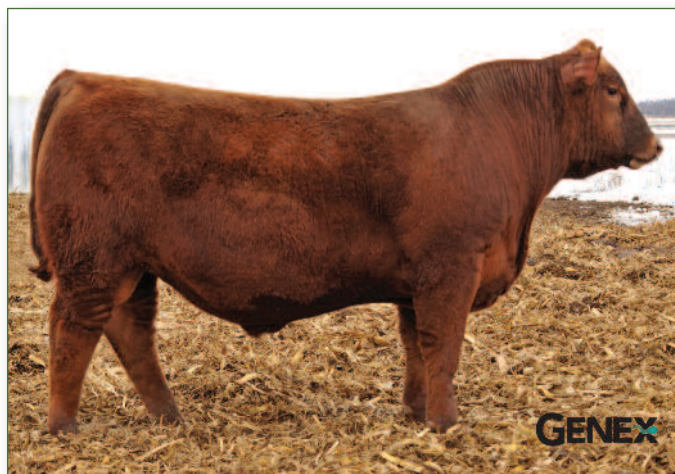
HXC Declaration 5504C Service Sire to Lots 63-64 and sire of Lot 70

BUF CRK CHF 824-1658 MRM 1431 8611 9109 3R 2595 HOB0 133G 3R MS TOUCH 143F 51H