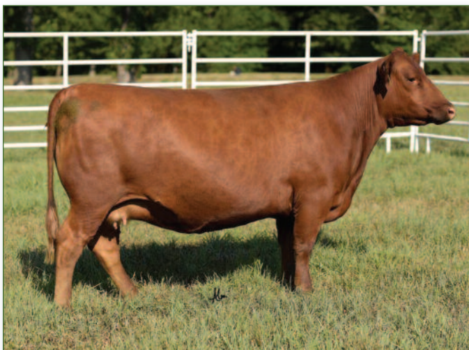
Brown Ms New Era A7084 • Dam of Lot 81 Embryos

Consignor: Rhodes Red Angus, LLC / Darryl & Susan Rhodes Maize, KS / H: 316-722-6900 C: 316-648-8310 / rhodesredangus2@gmail.com Some of the hottest genetics in the breed! A direct daughter of the $2 million Abigrace L7730 cow and the incomparable Mulberry 26P! Selling 3 #1 embryos one (1) extra embryo provided as the up front guarantee.