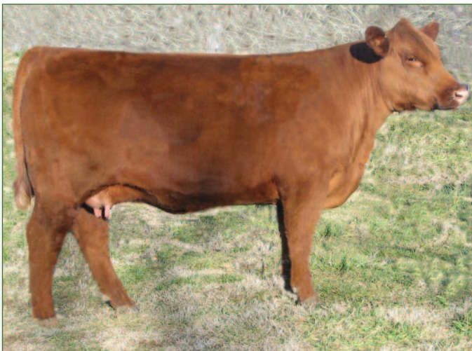
BHC Miss Bridget Dam of Lot 37 and Maternal Granddam of Lot 38