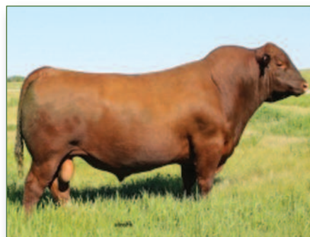
Bieber Let's Roll B563

Package B – Sired by Bieber Let's Roll B563, one of Rollin Deep's most exciting sons out of the great Basin Primrose 2043 with a 108 MPPA on 8 natural calves plus 105 ET calves to her credit. For power and muscle, this combination should be outstanding. First time this mating ever offered.