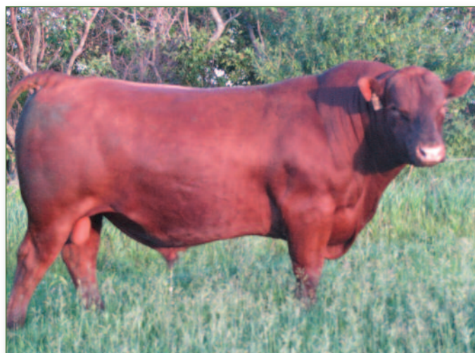
PIE Shooter 8012 • Sire of Lots 21-22

HXC MAGNUM 4464P PIE SHOOTER 8012 PIE NAKITA 6128 BECKTON JULIAN GG B571 HXC 701G LCB HOSS A444N PIE NAKITA 3125 LMG GILLS NO DOUBT 9018 BULL HILL JUANA 1011 BULL HILL JUANA 9002 RED TOWAW INDEED 104H LMG DYNETTE 3041 LJC MISSION STATEMENT P27 AHE JUANA 914