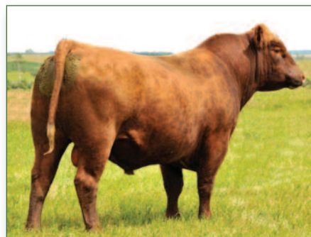
5L Independence 560-298Y

Package C – Sired by 5L Independence 560-298Y, one of the most popular sires from coast to coast. He has outstanding balance of his EPDs with 13 traits in the top 32% of the breed or better. First time this mating ever offered.