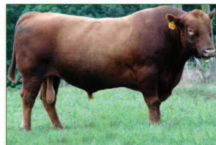
LCB Jewel Maker N155 Semen sells as Lot 85