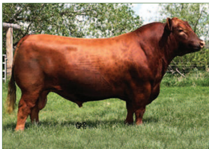
Red Six Mile Sasic 832S Sire of Lot 17 and Maternal Grand sire of Lots 15-16