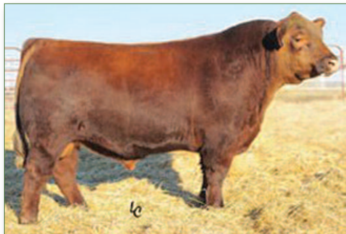
Andras New Direction • Sire of Lot 7

This heifer is out of the 12-year-old Basin Chinook cow that never misses. The Andras New Direction bloodlines have been sale toppers the last several years. This young cow has a lot of money making opportunities ahead of her!