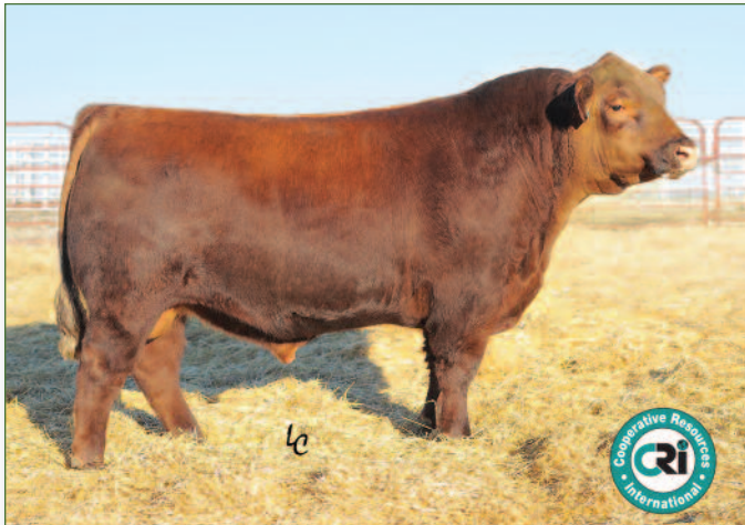
Andras New Direction R240 • Sire of Lot 75