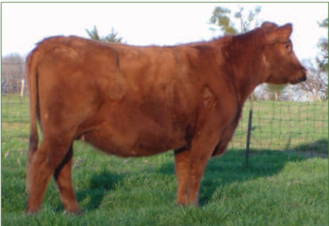
Bull Hill Prissie 3148 • Lot 20