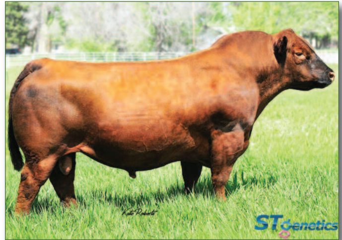
LSF Night Calver 9921W • Sire of Lot 73

This fancy New Direction heifer is the result of some embryos we bought in the Bet on Red Sale. We were really impressed with her dam who is from the Blockana Cow Family and boasts a 107.35 MPPA that was built in the very maternal CT Red Angus herd. We feel this heifer has almost unlimited potential. Breeding information available sale day.