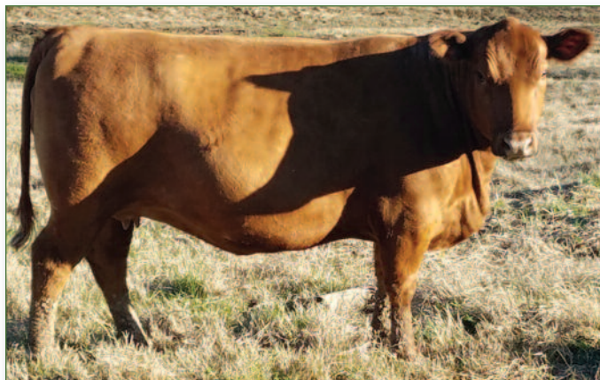
LRF Abby D69 • Lot 61